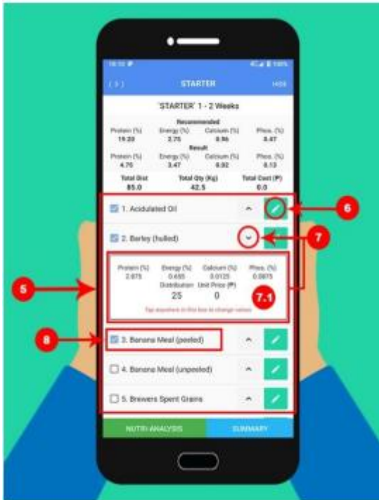
Figure 3 (b) Ingredients Menu

(1) Represents the total number of ingredients needed. (2) Show or hide the Recommended Ingredients needed for the chosen age of layer chicken and the Results of the mixed ingredients. (3) Displays the recommended amount of nutrients for mixing the ingredients. (4) Displays the calculated values of nutrients after mixing up three types of ingredients. (5) Shows the list of ingredients. (6) Shows the button for adding or modifying the values of nutrients of each ingredient until the desired nutrients arrive. (7) A button to show or hide the box (7.1) that contains values of the elements, distribution, meal price (optional), and the value of each ingredient. (8) Shows the name of ingredients with a checkbox.