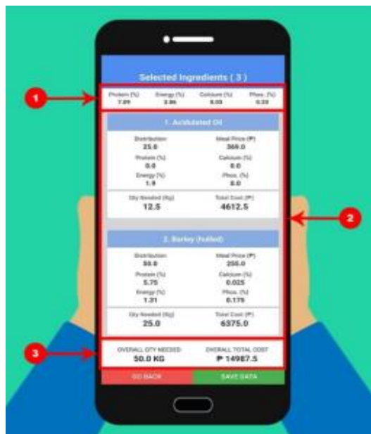
Figure 5 Save Data Menu