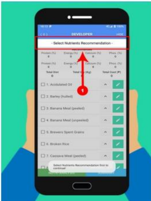
Figure 2 (a) Nutrients Recommendation Menu

Figures 3 (a & b) show the ingredients menu, where the user can select the available ingredients in their area and create a mix of them.