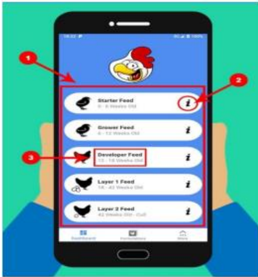
Figure 1 Application Dashboard