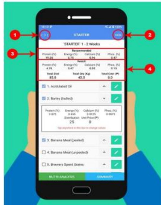
Figure 3 (a) Ingredients Menu